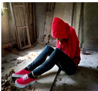
"Helping Hurting Kids"

Senior High youth meet twice a month on Sunday evenings from 6-8 PM (unless otherwise noted) for food, devotions and fun activities.