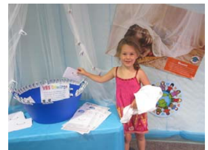
SKY VBS 2012