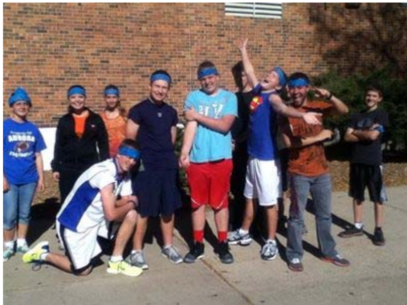
Mount Olive team at

Come and carol for people who'd love your joy. December 22!