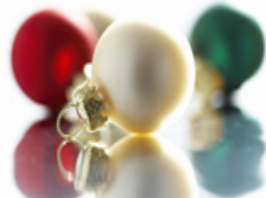
→ Christmas Luncheon

November 20 and 27. The winners will be selected at the very end of the bake sale on December 4 and announced on December 10/11.